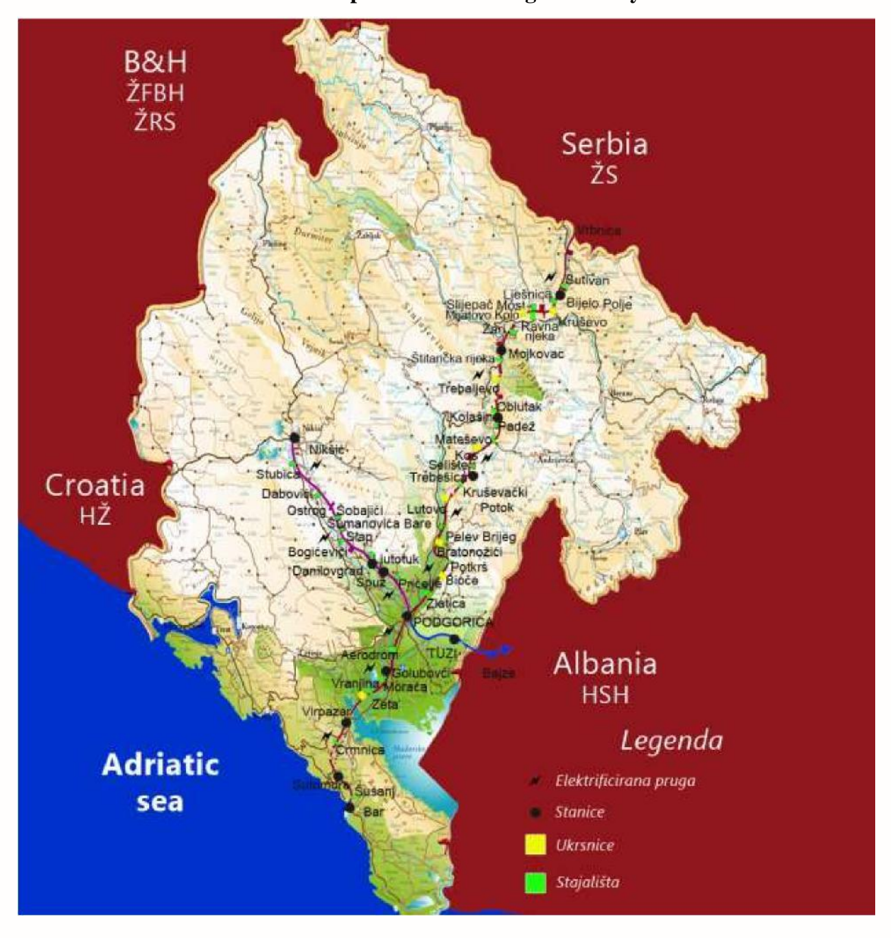
Annex 3. Stations and other official places on montenegrin railway network