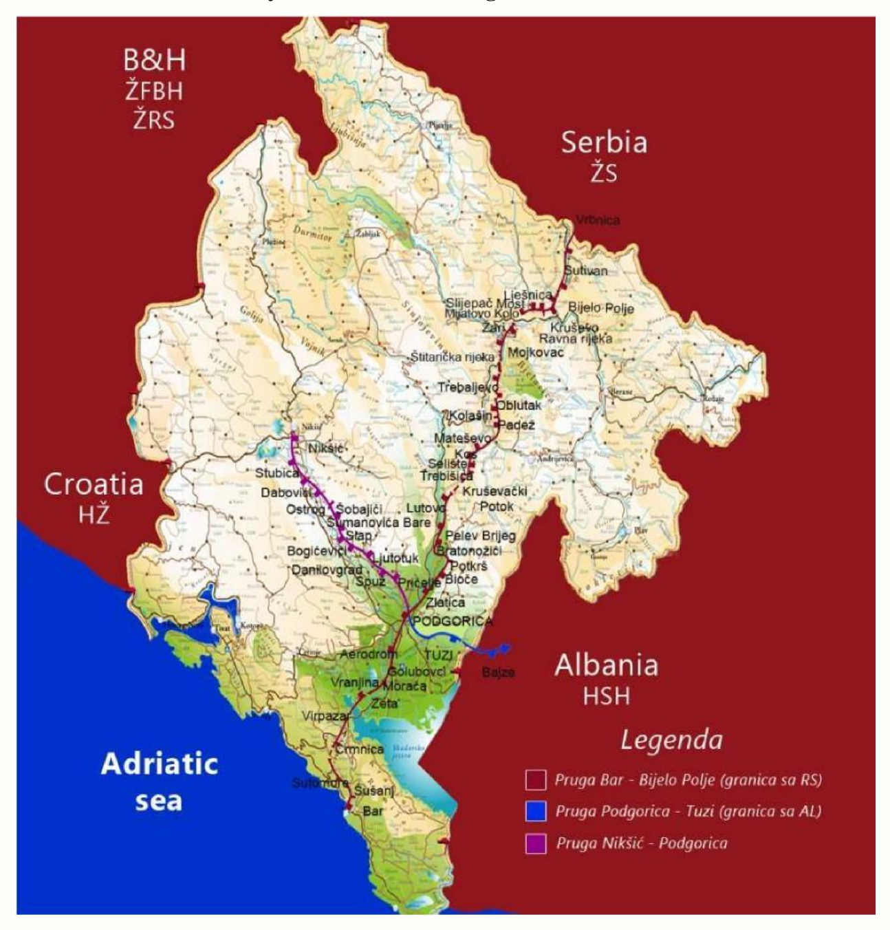
Annex 2. Review of railway network in Montenegro