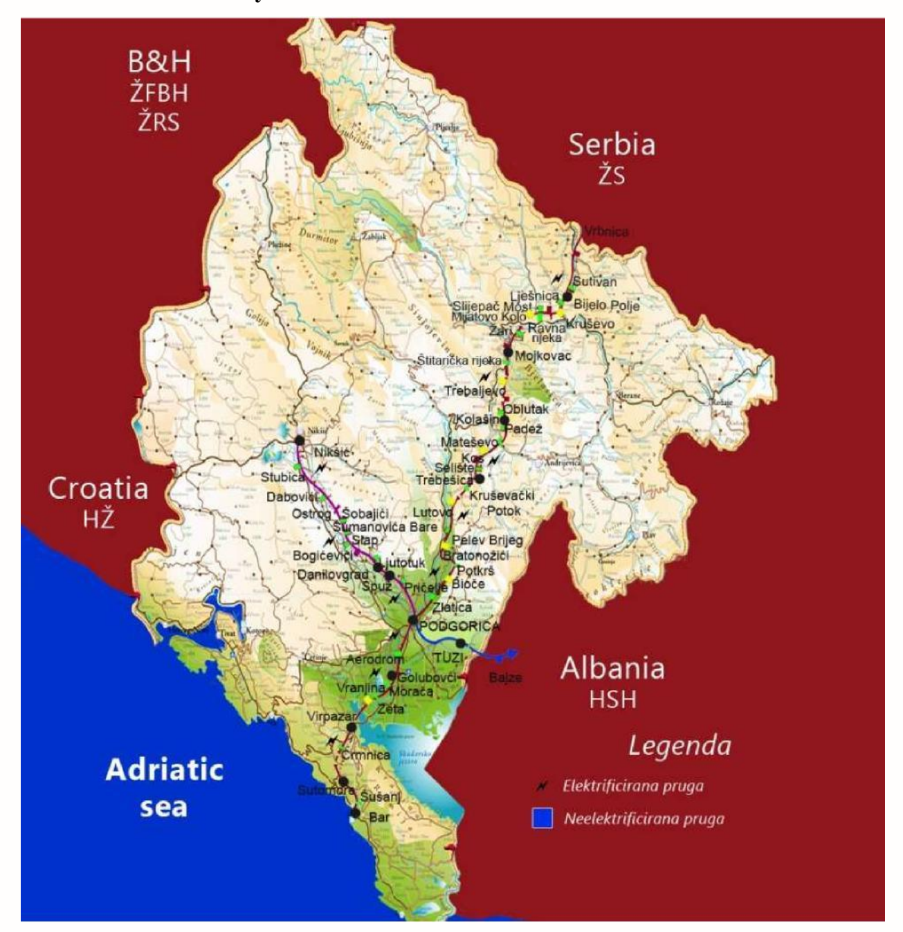
Annex 8. Electrification system